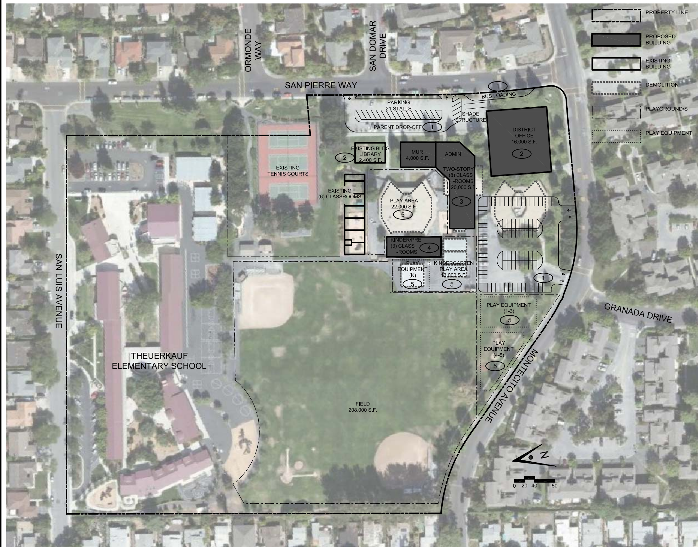
PROPOSED SCENARIO 1-DISTRICT OFFICE AND ONE SMALL SCHOOL